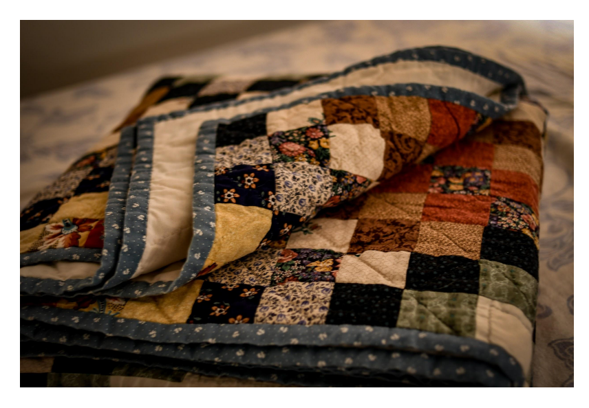
TOTAL POINTS (100)

Areas of Evaluation POSSIBLE POINTS Pattern submitted (1-5) Creativity —Pattern changes, color changes, originality (1-15) Overall beauty (1-15) Quilt top (2-20) Quilting stitches—Uniformity, size, hand- or machine-stitching goes through all layers of quilt (2-20) Size—Meets GYC Guidelines (1-10) Finishing for presentation